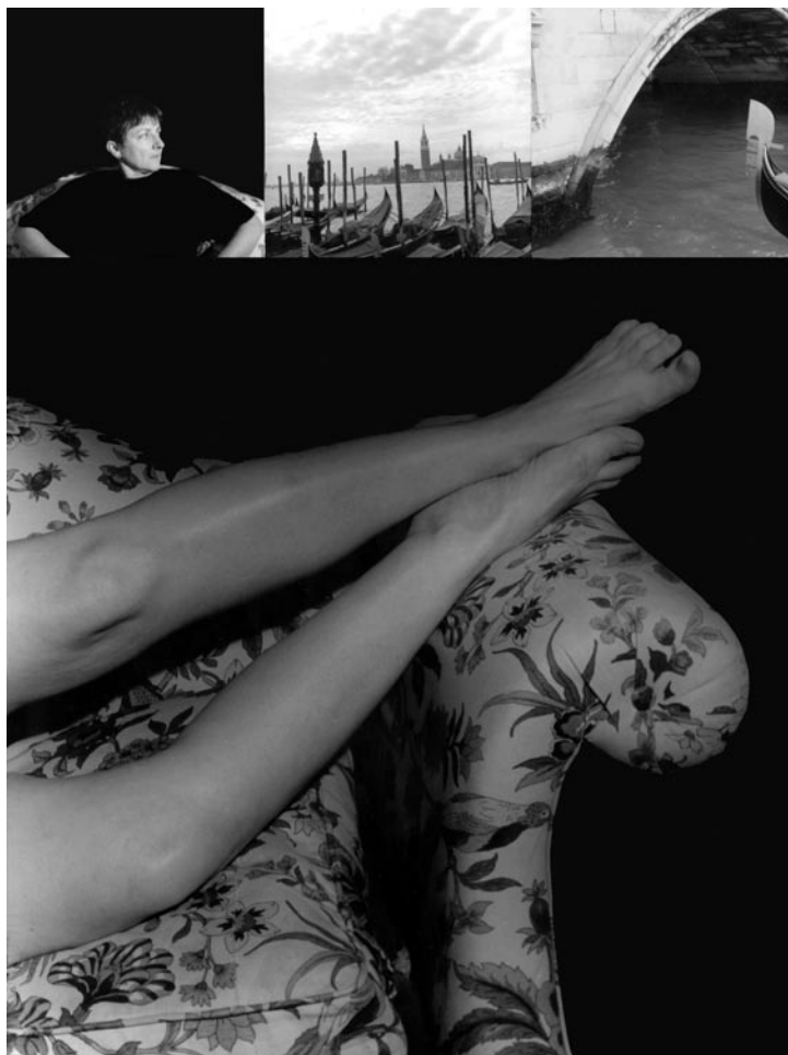
“Gondola,” from the series Return Trips